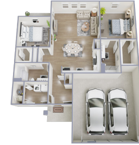
THE SOLSTICE 2 BED • 2 BATH 1,175 SQ FT