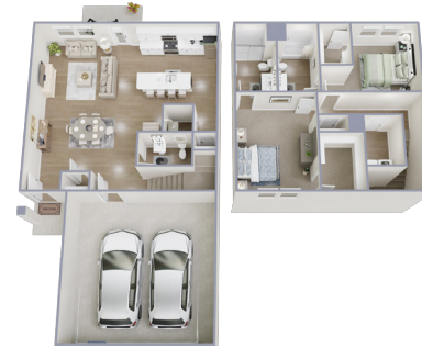
THE LUXE TOWNHOME 2 BED • 2.5 BATH • 1,445 SQ FT