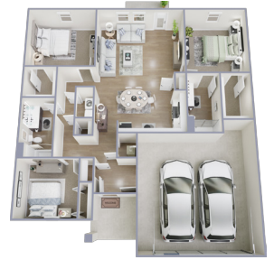
THE ELITE 3 BED • 2 BATH 1,376 SQ FT