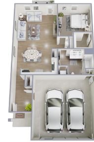
THE HAVEN 1 BED • 1 BATH 904 SQ FT