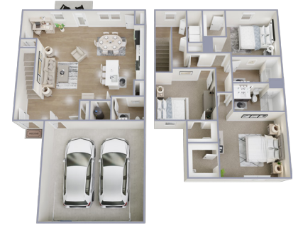
THE EDEN TOWNHOME 3 BED • 2.5 BATH • 1,711 SQ FT